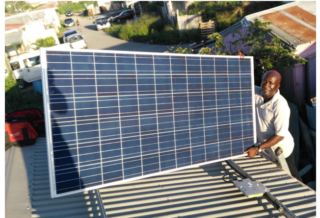
Antigua and Barbuda 4 MW wind and solar project